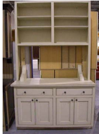
Buffet in maple wood, painted in biscuit w/marble glaze.

We are offering this lovely Jay Rambo buffet for sale on a first-come, first-served, as-is basis for only $988.99. This unit would be great for a breakfast room, dining room, or even a bedroom. It measures 59" wide, 25 1/4" deep and 95 1/2" high. Built of maple, it has inset construction, self-closing drawers, two sliding shelves behind each door, a matching wood top and two corbels. Check our new website, www.remodelatlanta.net for more great deals!