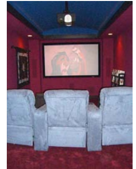
Family and friends love to gather in the theater to catch the latest film.

The homeowners and their guests love the results and think the cure was worth the treatment!